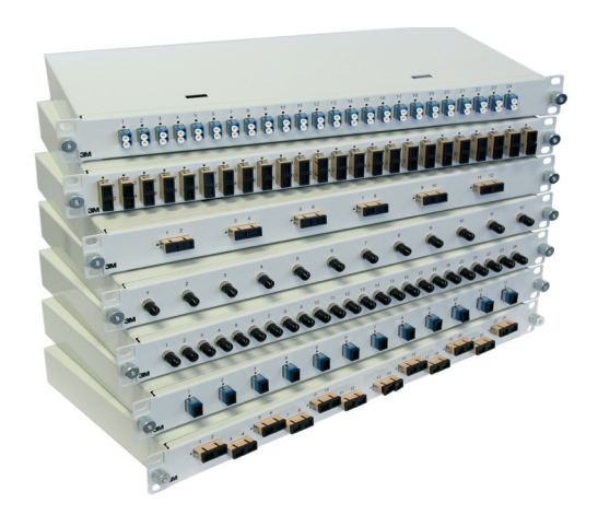
3M™ Eco SPP3 19" Fibre Optic Patch Panels

The Eco SPP3 patch panel range is designed as fibre optic patch panel mainly for backbone cable with pigtail splicing in splice cassettes, but can also be used for direct termination with e.g. the 3M Hotmelt- or NPC connectors.